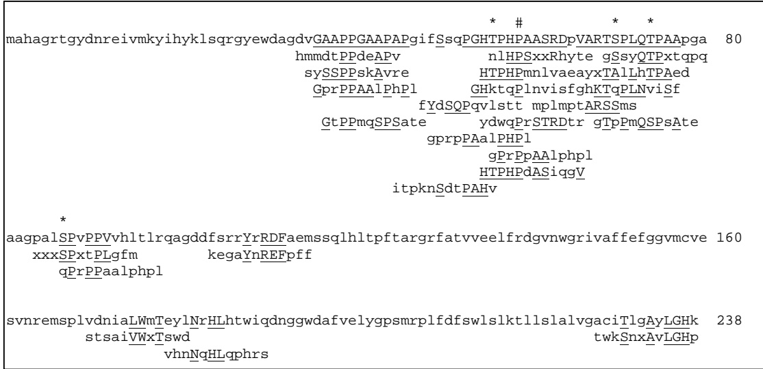
Figure 2 Alignment of all peptides in which at least one hexapeptide exhibited a similarity score of 18 or more with the Bcl-2 sequence as computed using the Blossum62 similarity matrix. Identical or similar amino acids are indicated by underlined capital letters.

These calculations provide a base-line by which to evaluate the significance of similarities observed between the sequences of the affinity selected peptides and the sequences of Bcl-2-homologs or tubulins.