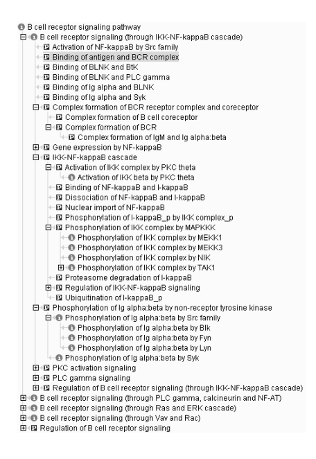
Figure 2. The relations between B-cell receptor signaling and the sub-pathways. The symbol "i" represents an "is-a" relationship; "P" indicates a "part-of" relationship.

antigen and BCR complex (IEV:0001278)" is part-of "B cell receptor signaling (through IKK-NF-kappaB cascade) (IEV:0001298)" (Figure 2).