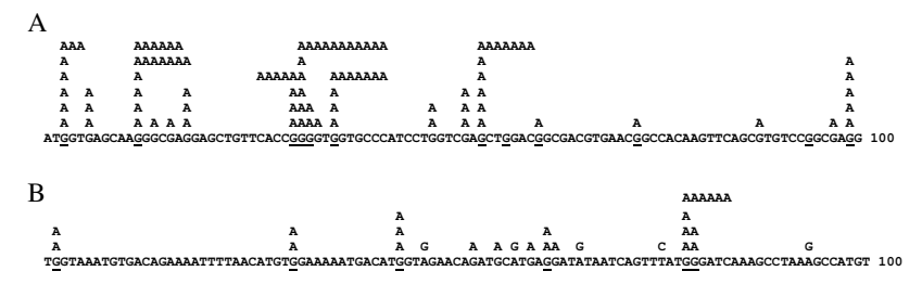
Figure 3. Example of mutation spectra generated by APOBEC3G expression in E. coli and mutation spectrum in HIV-1 retrovirus in the absence of the Vif protein. Potential hotspot positions within <u>GG</u> mutable motifs are underlined. (A) Spectrum of mutations in the first 100 bases of the GFP gene induced by the expression of APOBEC3G [47]. (B) Spectrum of mutations in HIV-1 DNA in the absence of the Vif protein [45].

Specificity of APOBEC3G for \underline{G}G sequences, which is frequently a part of TGG tryptophan codons, results in a frequent generation of TAG nonsense codons which leads to a premature termination of protein synthesis. This might be a genetic strategy to kill the virus, and the APOBEC3G hotspot specificity is determined by its biological role. The mutagenic activity of APOBEC3G might have perspectives for novel anti-HIV therapies that interfere with this virus-host interaction.